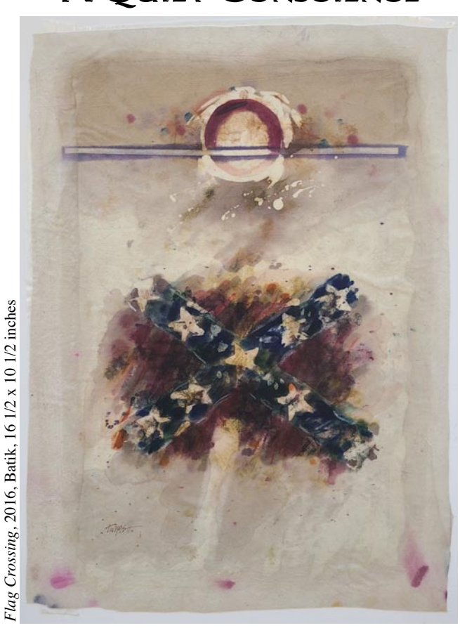
June 16 - August 26, 2023

OPENING RECEPTION FRIDAY, JUNE 16, FROM 6 - 8 PM