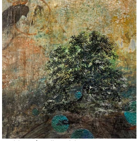
Work by Leah Mulligan Cabinum

Adapted from the original larger installation, sow II, is made from discarded