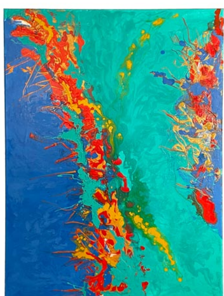
Work by Jane Nodine

Cherokee Alliance of Visual Artists Gallery, 210 West Frederick Street, located in the former Old Post Office building one street over from the Main Street with the City of Gaff-