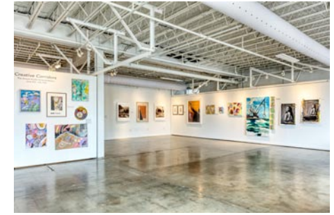
View of the exhibition

Redux was recently honored to be voted Best Art Gallery in the Charleston City Paper Best of Awards 2023. This group exhibition is an institutional tradition and an opportunity for Redux resident artists to showcase a sample of their work, in relation to a theme. This year, our artists are working with the selected theme of "Reclaim" in varied media. Redux currently serves as a studio home to 40 Charleston artists and it is Page 4 - Carolina Arts, June 2023