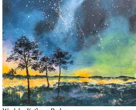
Work by Kathryn Parker

In Light and Life: Scenes of the Low-country, featuring works by Kathryn Parker focuses on familiar Lowcountry landscapes as a means of exploring her expressive impasto style of painting. Though many of her paintings are initially inspired by a photograph or memory, she only loosely refers back to the original image and instead uses her subject as a means to explore the textural possibilities of her medium. Using a combination of oil and coldwax, Parker creates highly textured paintings with visible, expressive brushstrokes.