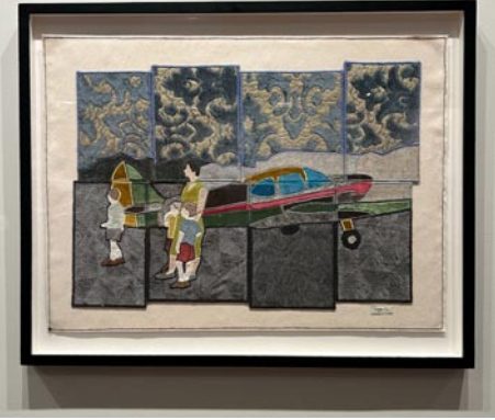
Work by Caitlin Cary

This legacy provides a fitting backdrop for an exhibition that brings together some of the state's most dynamic fiber artists. Drawing inspiration from TAG's central location in downtown High Point - surrounded by landmarks like the Rockers Stadium, The Commons, and Visit High Point - Needle & Thread explores how artists use playfulness as both a concept and a process. Curated with a sense of wonder and whimsy, the exhibition invites visitors to engage with textiles in unexpected and