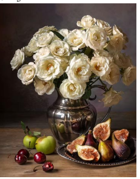
Work by Yana Slutskaya

The Art Gallery at Congdon Yards (TAG) is High Point's premier destination for the visual arts. Located in the heart of Congdon Yards, TAG showcases diverse artwork from established and emerging artists in various media. The gallery offers a variety of art classes, workshops, and special events for all ages and interests. TAG is committed to making art accessible and inclusive for continued above on next column to the right