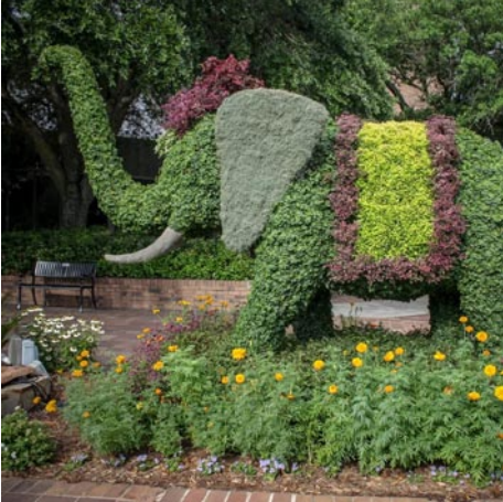
View of the Greenwood Flower Festival

Landscaped areas in Uptown Greenwood, June 1 - July 6, 2025 - "18th Anniversary Topiary Celebration," during the annual SC Festival of Flowers. When it comes to flowers, everyone loves the topiaries - from the majestic elephant to the dabbling ducks to the Safari Jeep. You will be astonished to see the variety of sculpture sizes, plants, colors and textures. In all, 57 unique "living" creations are uniquely set in landscaped areas in Uptown Greenwood. Each topiary has been adopted by an organization and is sponsored by a separate organization. Contact: ( www.scfestivalofflowers.org ).