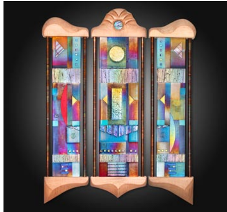
Work by Paula Marksbury

Nearly 200 juried artists of the Southern Highland Craft Guild will be selling works of clay, metal, wood, jewelry, fiber, paper, natural materials, leather and mixed media. With styles ranging from traditional to contemporary, the Fairs showcase the rich talent, diversity and craft mastery of Guild members.