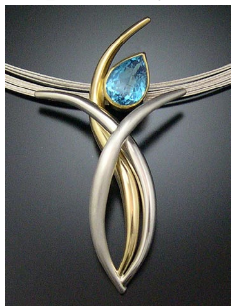
Work by Jody Ochs

Monty Phillips' current work is an exercise in exploring the possibilities of vitreous enamel on sterling silver and copper in regards to form, texture, color and