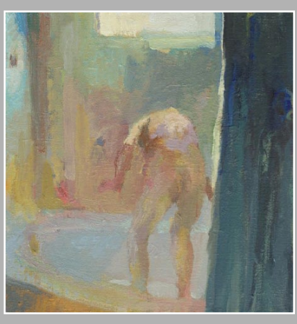
by Greg Siler