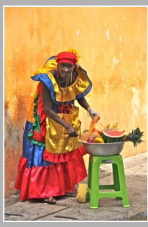
by Lisi Szymczyk

elder gallery 1520 South Tryon Street Charlotte, NC 28203 704-370-6337 www.elderart.com