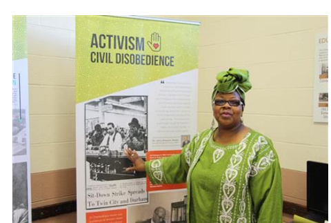
View from the Black Culture Pop Up Museum

The Arts Council is the chief advocate of the arts and cultural sector in Winston-Salem and Forsyth County. Our goal is to serve as a leader in lifting up, creat-