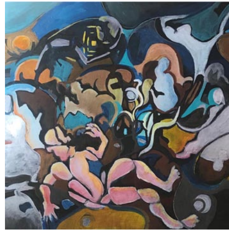
Vork by Abraham Brown

Brown utilizes a wide range of media, including sculpture, video and complex