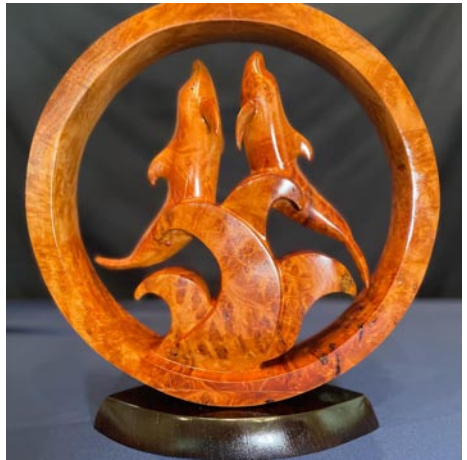
Work by Stephen Vadakin

The exhibition features an exciting array of new 3D works of frogs, fish, turtles, and birds crafted in copper, rare woods,