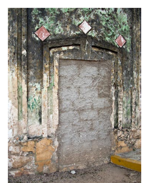
Work by Ygnacio Rivera

ORACLE, Círculo Internacional de Críticos y Promotores de la Fotografía en los encuentros de 1995 en Daytona, Estados Unidos y 2002 en Colonia y Berlín, Alemania.