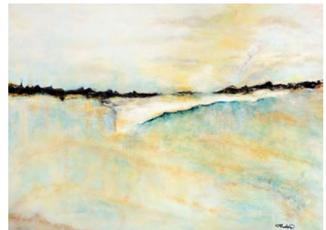
Work by Sally lordeon

All artists, whether realistic or abstract, use the same visual language to put together their paintings. The difference is that realistic artists use that visual language to describe their subjects, whereas abstract artists use the same visual language, in conjunction with subject matter, to express feelings or ideas. From Realism to Abstraction focuses on that 'perfect' blend of creating both types of beautiful compositions and invites viewers to participate in an epic art journey along the way.