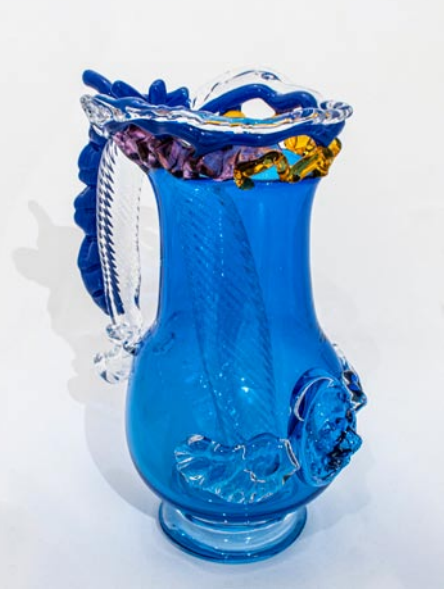
"Trick Cup" by Fritz Dreisbach

Fine Art Museum, Fine & Performing Arts Center, Western Carolina University, Cullowhee. Through July 29 - "Cultivating Collections: Vitreographs, Glass, and Works by Black Artists". The exhibit is a multi-year series of exhibitions that highlights specific areas of the WCU Fine Art Museum's Collection, which includes over 1,800 works of art in a wide range of media by artists of the Americas. This year, Cultivating Collections reflects on three areas of the Collection vitreographs, glass, and works by Black artists. Key works in each area come together to tell the story of past, present, and future collecting directions. Ongoing - The WCU Fine Art Museum is currently offering an interactive 360° virtual tour of the exhibition, "Cultivating Collections: Paintings, Ceramics, and Works by Latinx and Latin American Artists". This multi-year series of exhibitions highlight specific areas of the WCU Fine Art Museum's Collection, which includes over 1,800 works of art in a wide range of media by artists of the Americas. As the Museum's holdings increase, either through donations or purchases, it is essential for the Museum to evaluate strengths, identify key acquisition areas, and also pinpoint where significant change is needed. Throughout the fall more virtual events will be available. learn more at arts.wcu.edu/cultivatingcollections. Hours: Tue.- Fri., 10am-4pm & Sat., 1-4pm. Contact: 828/227-3591 or at (https://www.wcu.edu/ bardo-arts-center/fine-art-museum/).