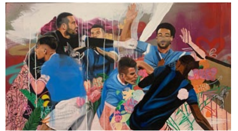
Work by Riivo Kruuk

Artists tend to gravitate to communities in an effort to establish a basis for self-expression and self-definition as it relates to their artistic practice. As creative communities develop, artists inherently enrich one another as their individualized creative expression inspires and influences others within their communities.