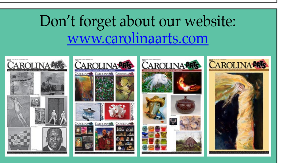
You can find <u>past issues</u> all the way back to August 2004!

Check us out at (www.carolinaarts.com) or e-mail to (info@carolinaarts.com)