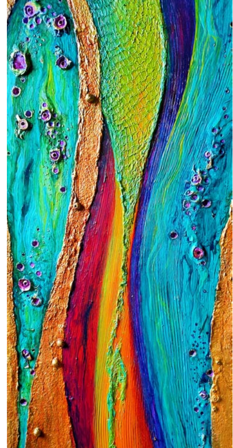
Work by Laura Gammon

On Beauty: The Prophet is an exhibition which celebrates the 100 year anniversary of the publication of "The Prophet", a book of 26 prose poetry fables, by displaying