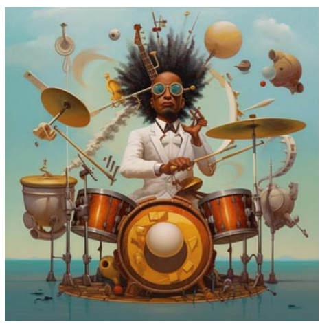
AI work by Owen Daniels

Could they have created these images on their own without the use of AI? Sure they could with time, but why not use the tools available? It's much faster once you learn the process.