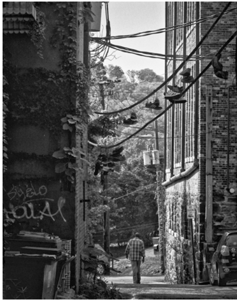
Work by John Newton

The Black Mountain Center for the Arts (BMCA) is a non-profit community arts center housed in the renovated old City Hall in Black Mountain. It hosts six to eight group and individual exhibits annually.