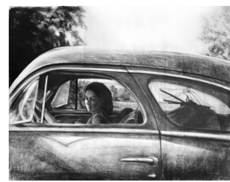
Work by Eva Crawford

Following the passing of her father in Jan. of 2021, Crawford sought to create a body of work focused on the preservation of memory. Crawford reclaims lost memories through the use of portraiture, transforming antique film photographs into large-scale drawings and paintings that invite the viewer to create their own stories and memories about the individu-