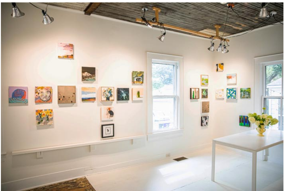
View of the "Annual Small Works" exhibit

Art & Light Gallery in Greenville, SC, will present its Annual Small Works exhibition featuring the work of participating gallery roster artists, in celebration of their milestone seventeenth anniversary, on view from Aug. 1 - 26, 2023. A reception will be held on Aug. 4, from 6-8pm.