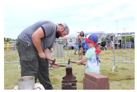
Artrageous blacksmithing at Dowdy Park in 2019.