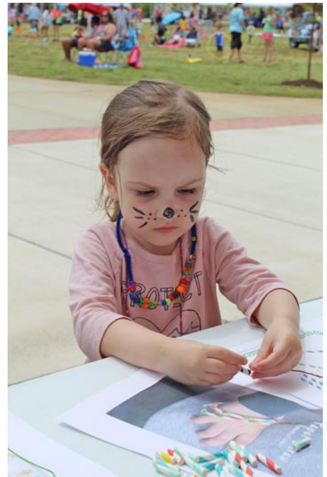
Artrageous fun at Dowdy Park in 2019.

Organizations and businesses interested in hosting a kids art activity and artisans interested in selling their works at Artrageous can find the applications online at (DareArts.org/artrageous. DareArts.org/artrageous) or call 252/473-