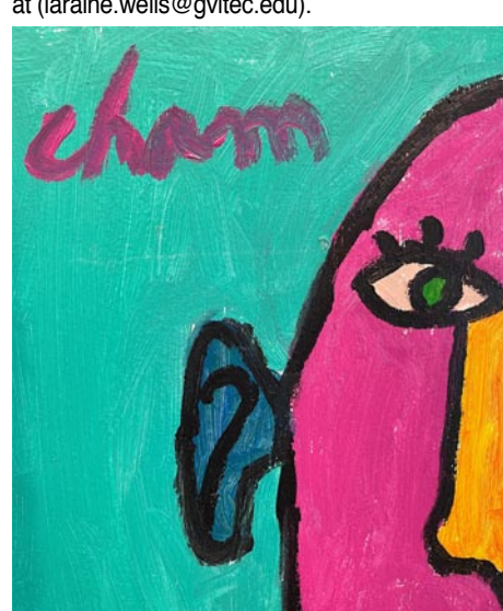
Work by Cham Little

ALTERNATE ART SPACES - Greenville Centre Stage Theatre Gallery, 501 River Street, Greenville. Through Oct. 1 - Featuring works by Cham Little. "People often ask me what I see in my work. I see beauty in the colors. It doesn't have to be a particular subject. I would hope that my art could be enjoyed without understanding what it represents, but for the joy it brings and for the way the colors somehow come together." Ongoing - Featuring works by visual art members of MAC. Exhibits are offered in collaboration with the Metropolitan Arts Council. The exhibit can be viewed virtually at (www.greenvilleARTS.com/virtualgallery). Hours: Tue.-Thur., 2-5pm & 2 hr. prior to shows. Contact: MAC at 864/467-3132, at (www.greenvillearts.com).