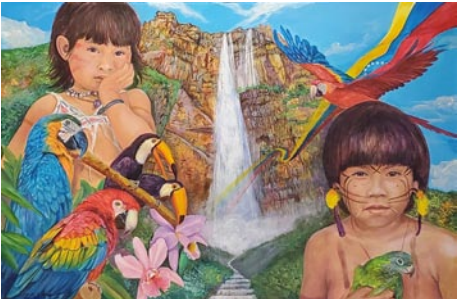
Work by Luz Celeste Figueroa

Several special events are associated with the exhibit. Visitors can view a mural on the exterior of the Morris Center designed by Jesse Aguirre and painted by local high school students as well as meet the artists on Sept. 11, at 5pm. VeMe Day is Sept. 25, from 11am to 1pm.