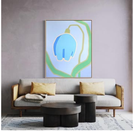
Work by Julia Deckman

Emeline, 181 Church Street, Charleston. Ongoing - Located in Charleston's historic district, Emeline is a clever and thoughtfully designed retreat crafted with the curious traveler in mind. The experienced team embodies the persona of a consummate host, always focused on the vibrant days of hospitality. Emeline's accommodations provide a warm welcome after a busy day exploring all the notable points of interest that lie just outside its doors. This captivating refuge with 212 all-king bed guest rooms includes 128 luxury suites and 16 double king bed accommodations. Hours: reg hotel hours. Contact: 843/577-2644.