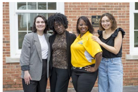
People involved with The Athenaeum Press

Hagerty's acute attention to detail, unquenchable thirst for knowledge and understanding of both concrete and abstract intellectual concepts and enthusiasm to share his thoughts and findings on canvas are what makes his art so compelling. His paintings are inviting and approachable by way of their whimsical imagery and happy color palettes and are brimming with repeating depictions of fantastical figures, dreamscapes, symbols and shapes that develop into a familiar visual language for the viewer. According to Hagerty, surrealism is a vehicle "to explore and express my obsessions with deep history, fascination with myth and symbol and inexhaustible curiosity about color and form."