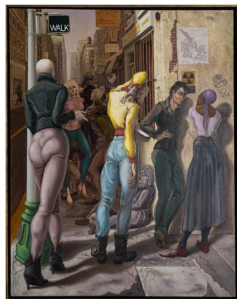
Work by Robert Garey

For further information check our SC Institutional Gallery listings, call the Museum at 843/238-2510 or visit ( www.myrtle-beachartmuseum.org ).