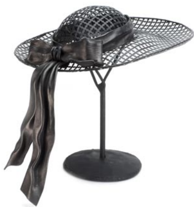
Work by Elizabeth Brim

Richland County Public Library , 1431 Assembly St., Columbia. Ongoing - Featuring 20 pieces of public art on permanent display. Hours: Mon.-Fri., 9am-9pm; Sat, 9am-6pm; Sun, 2-6pm. Contact: 803/988-0886 or at ( www.richlandlibrary.com ).